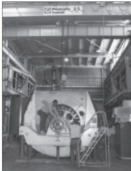
6000 HP motor in assembly

Electric motors are not a sideline with Longo ... no bearings, no belts, etc. We are electrical-mechanical professionals who service and sell line-to-load equipment. It's part of our name - Longo Electrical-Mechanical, Inc. New electric motors, VFD's, pumps, and parts are stocked in abun-