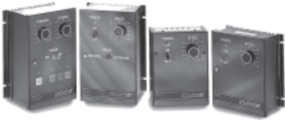
GV 3000 1-400 HP